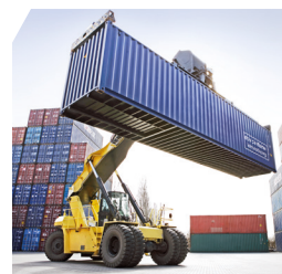
Economics and trade